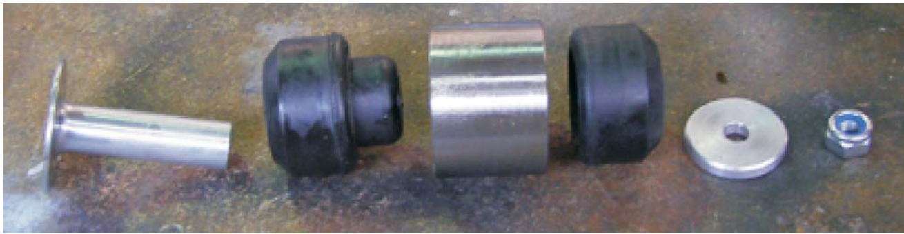
2 Top are "cups"